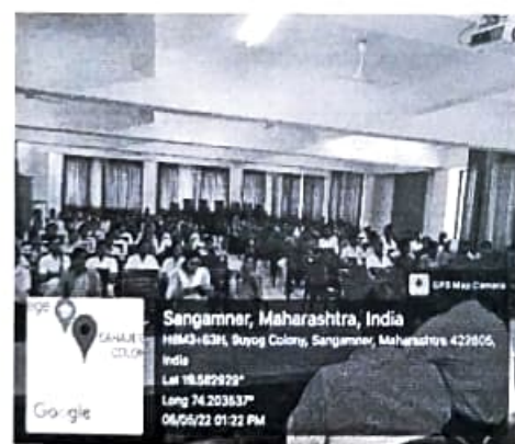
Guidance to students