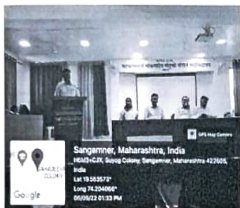
Introduction of guest lecturer