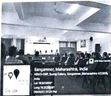
Guidance to students