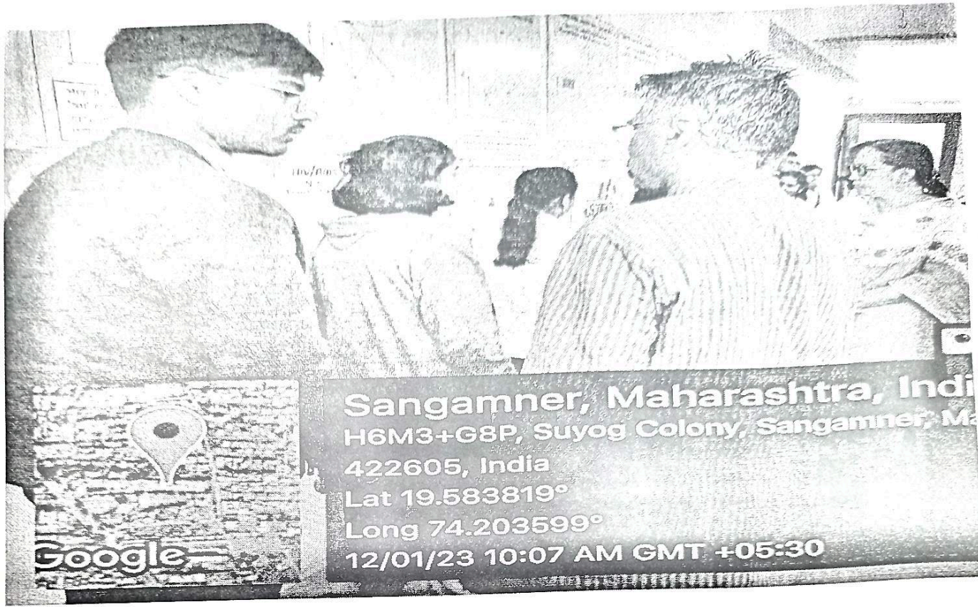
Poster Presentation Activity Under Red Riban Club