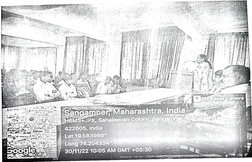
HIV awareness lecture under Red Ribbon Club