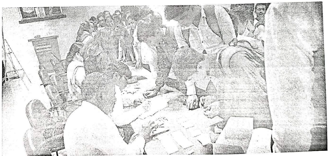
Under HIV awareness Program conduct HIV Testing Camp